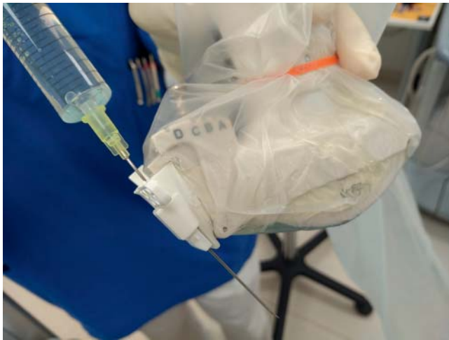
► Fig. 6 Ultrasound probe with puncture adapter. The guide adapter is attached to the ultrasound probe under the sterile cover. The sterile disposable needle guide is clamped on top. The ultrasound probe cover also covers the cable.