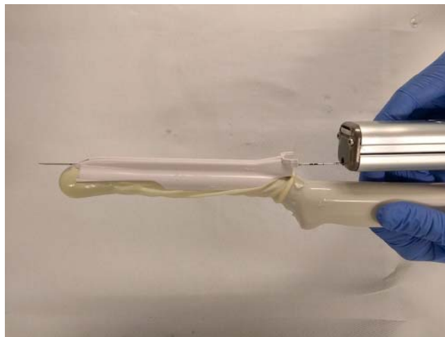
► Fig. 5 Rigid endoscopic ultrasound probe with puncture adapter. The ultrasound probe is first covered with a low-germ cover that is partially filled with ultrasound gel. The disposable needle guide is mounted over this.

As thermolabile devices, guide adapters that can be clamped to the ultrasound probe (► Fig. 6 ) are to be disinfected at least once and covered with a sterile cover. Injection needles and