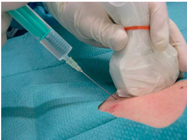
► Fig. 3 Correct application of the sterile ultrasound probe cover in a freehand biopsy with possible contact between the needle and the ultrasound probe. The examiner is wearing sterile gloves. A sterile drape/incise drape as a barrier precaution is obligatory when tools (e. g. syringe) must be changed/set down during puncture.