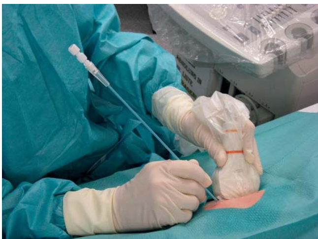
► Fig. 4 Placement of an abscess drainage tube. Ultrasound probe, cable, and keyboard are covered with sterile covers. Following hand disinfection, the examiner is dressed as in a surgical situation. A sterile drape/incise drape serves as the barrier precaution. A sterile ultrasound gel is used as the contact medium. A sterile work table is additionally available.

in the instructions for use. Proof of efficacy with recognized methods must be documented by an expert opinion (...)” [14]. This requirement was included in the ultrasound agreement in 2017 [36].