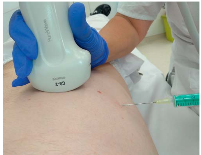
► Fig. 2 A safety distance between the ultrasound probe and the sterile needle is maintained in this freehand biopsy. If the examiner can ensure that the needle will not come into contact with the ultrasound probe, a sterile ultrasound probe cover is not necessary.

after every use is sufficient here. Disinfectants with only bactericidal and yeasticidal (yeast killing) activity are to be used.