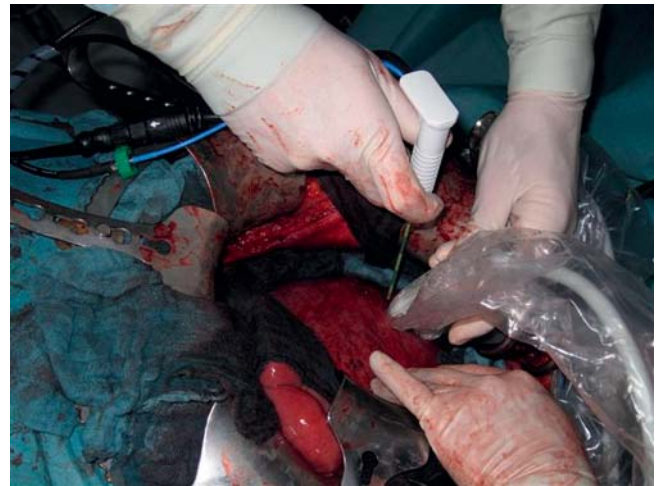
► Fig. 8 Intraoperative ultrasound with intervention. The sterilized ultrasound probe or probe treated with bactericidal (including mycobacteria), fungicidal, and virucidal immersion disinfection is packed in sterile packaging. The examiner is dressed like a surgeon.