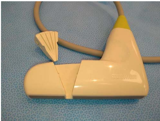
► Fig. 7 Ultrasound probe with puncture channel with removed needle guide. As a rule, these ultrasound probes and needle guides must be sterilized since the needle in the channel touches both parts.

In November 2014, the Regional Anesthesia Working Group of the German Society of Anesthesiology published its S1 guidelines, which require that the ultrasound probe and cable be covered with a suitable sterile cover in ultrasound-guided regional anesthesia. No differentiation is made between “single shot” and “catheter-based” regional anesthesia. Moreover, only sterile ultrasound gel or another sterile fluid can be used to improve image quality. In addition, all persons participating in catheter implantation must wear a surgical cap and a new surgical mask. In single-shot puncture, only a surgical mask is necessary. The sterile gown and surgical cap can be dispensed with [20].